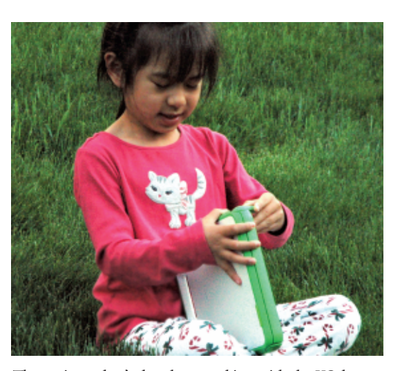
The main author's daughter working with the XO laptop.

The first batch of XO laptops was released in December 2007 (one is shown in Figure 1) and received good reviews with regard to its innovative hardware design. However, the near- and long-term future of the XO laptop remains uncertain because of the lack of empirical field data and other potential social and cultural concerns (Perry, 2007).