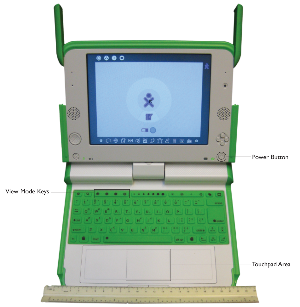
Figure 1. A picture of the XO laptop highlighting various parts of the machine. A ruler at the bottom provides scale.

Using the keyboard. All the HCI experts indicated that the keyboard (shown in Figure 1) is small for adults but may be acceptable for children's smaller hands. All the children in the study expressed that they found the keyboard to be unusual.